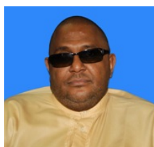
Hon. Abubakar Zein Member of Trade Committee East African Legislative Assembly Kenya

Hon. Abubakar Zein is a member of the Committee on Regional Affairs and Conflict Resolution, and the General Purpose Committee of the East African Legislative Assembly (EALA), the legislative arm of the East African Community (EAC).