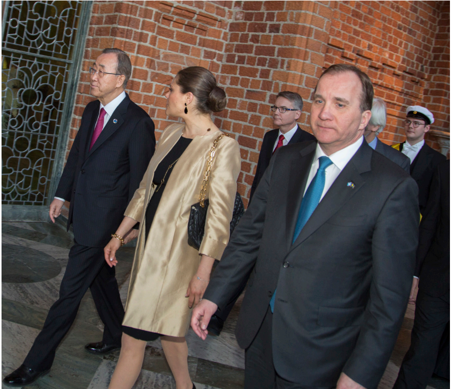
Secretary-General Ban Ki-moon, Crown Princess Victoria of Sweden and Prime Minister Stefan Löfven, Prime Minister of Sweden before the Lecture.