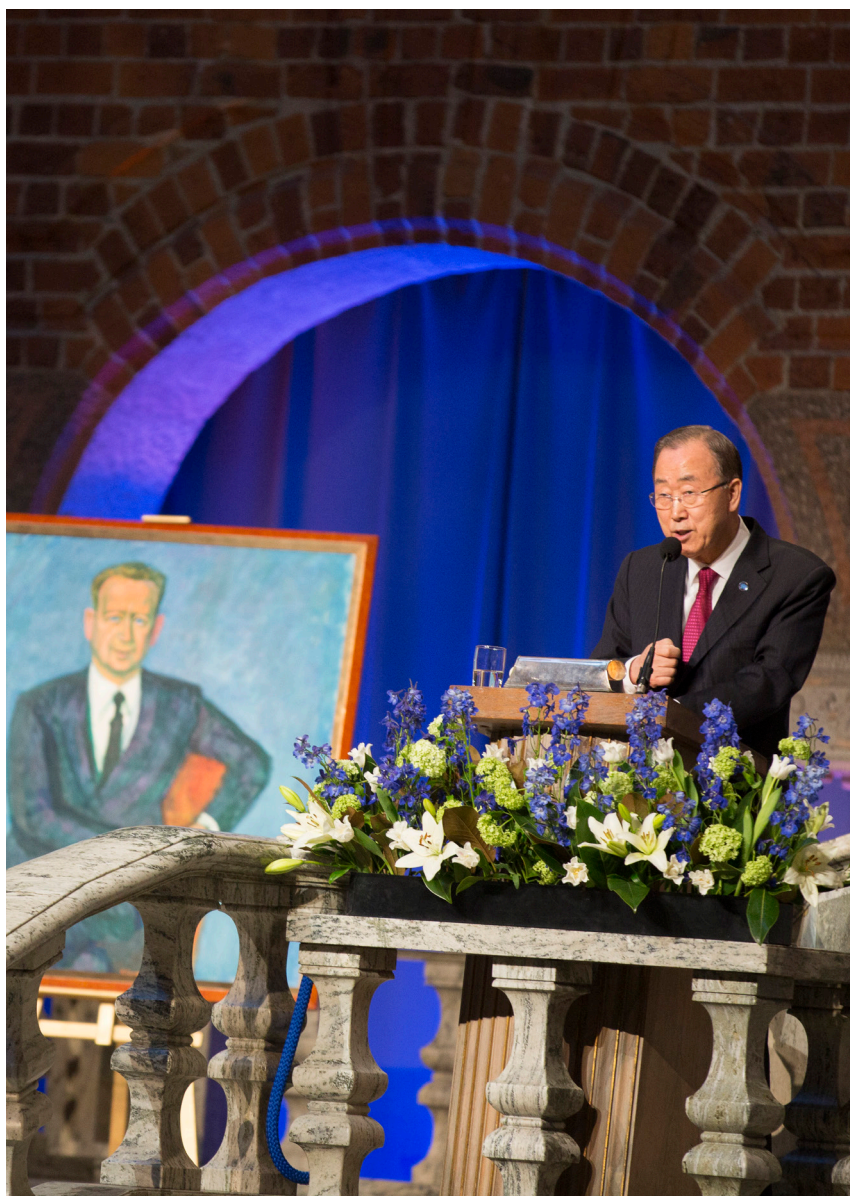
Ban Ki-moon delivering the 2016 Dag Hammarskjöld Lecture.