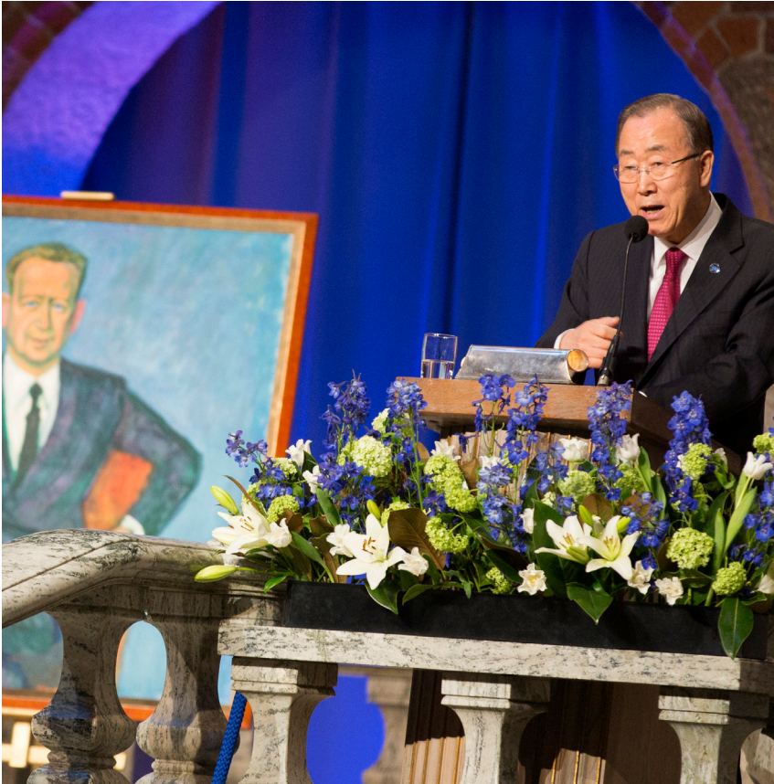
Dag Hammarskjöld painted by Bo Beskow and Ban Ki-moon delivering the 2016 Dag Hammarskjöld Lecture.